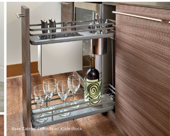
Base Cabinet Pullouts w/ Knife Block