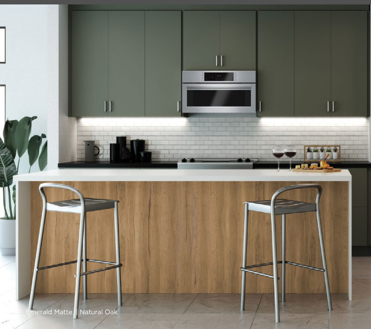
Emerald Matte | Natural Oak