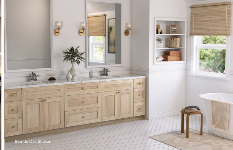
Blonde Oak Shaker