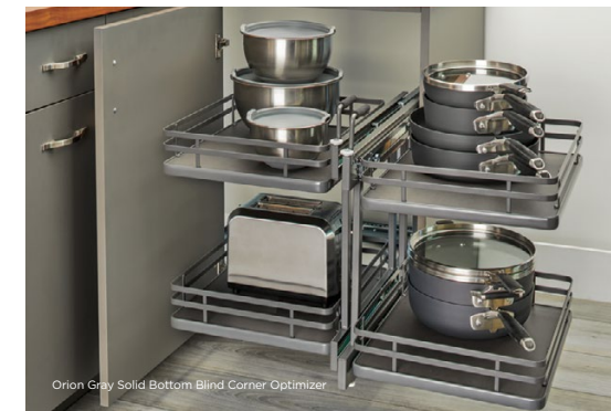
Orion Gray Solid Bottom Blind Corner Optimizer

Cabinets featured in these images are primarily a backdrop to showcase the new accessories and may not fully represent Innovation Cabinetry's current offering.