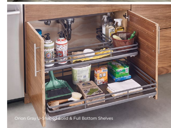
Orion Gray U-Shape Solid & Full Bottom Shelves