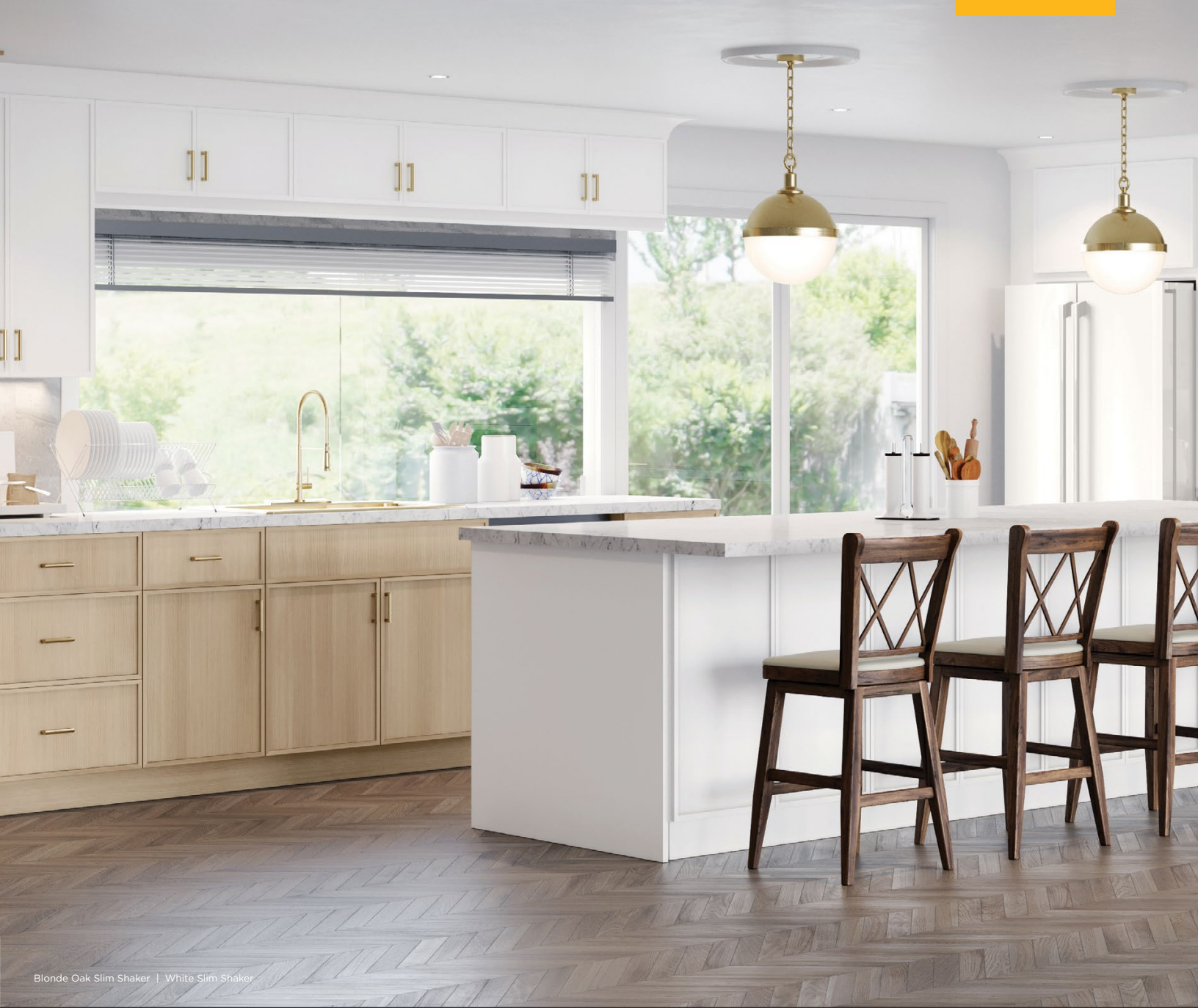
Blonde Oak Slim Shaker | White Slim Shaker

Discover the many details that make URBAN™ like no other brand.