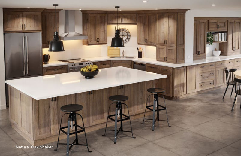
Natural Oak Shaker